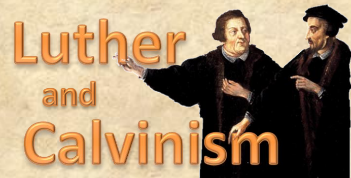
Image and Reception of Martin Luther in the History and Theology of Calvinism

International Conference of the Johannes a Lasco Bibliothek, Emden organized as a RefoRC project